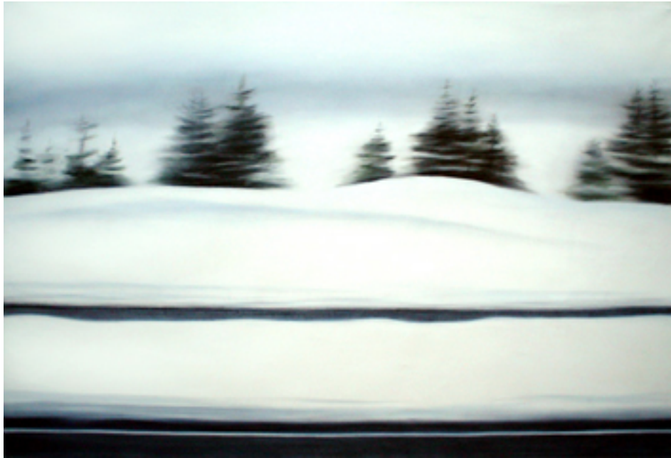
Quebec Drive, Winter Hill, 40" x 60" , oil on canvas